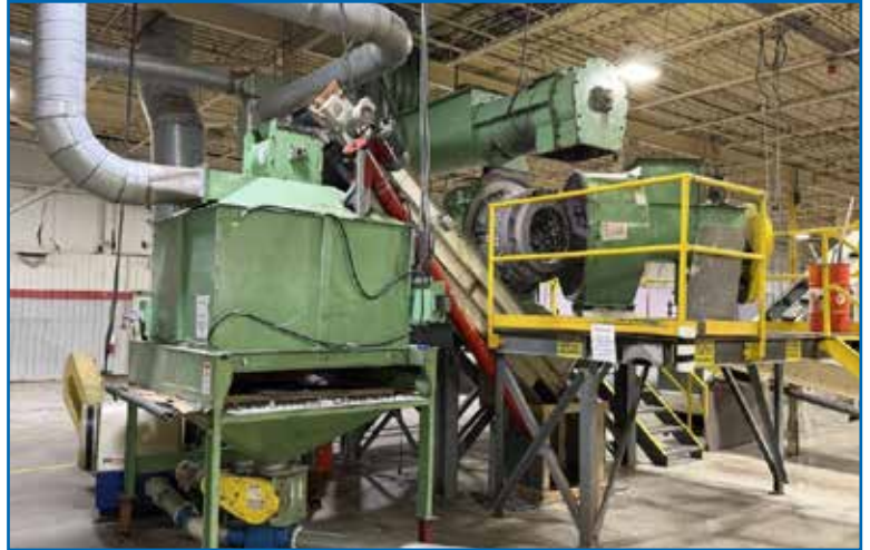
CALIFORNIA PELLETT MILL/CPM SERIES 7900-8 PELLETT MILL