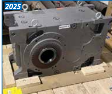
NORD MAXXDRIVE SK 7207ABH GEARBOX REDUCER