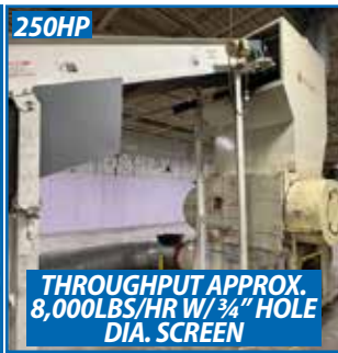
ROTOGRAN R00360 HD GRANULATOR