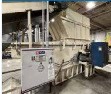
RETECH HEAVY DUTY INDUSTRIAL SHREDDER