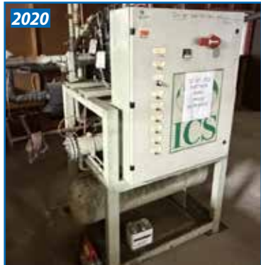
ICS SYSTEMS SHA-40-RO CHILLER