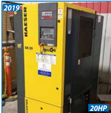
KAESER SK 20 COMPRESSOR