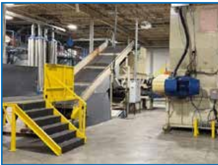
LDPE / PLASTIC SIZE REDUCTION & PELLETIZING LINE