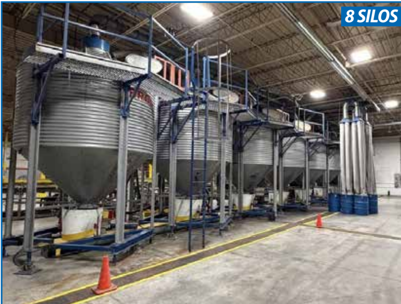
BROCK/FLYING DUTCHMAN INDOOR BULK MATERIAL STORAGE & HANDLING SYSTEM