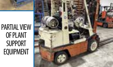
PARTIAL VIEW OF PLANT SUPPORT EQUIPMENT